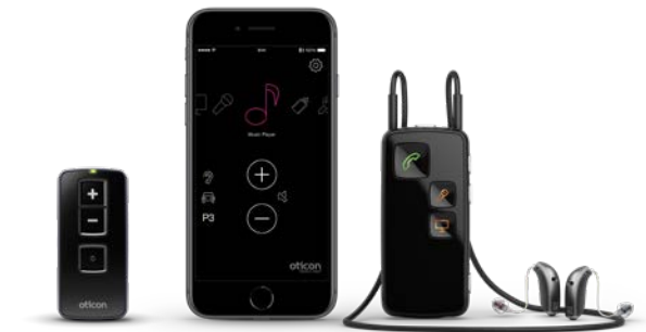
Note: ConnectLine is not available with all in-the-ear styles.